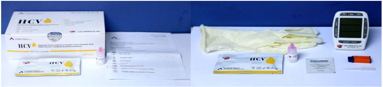
As shown above, prepare all items for testing. (Alcohol Swab, Lancet, Timer and Gloves are not provided in the test kit, but they must be available.)