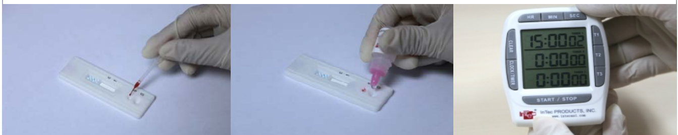
Add 1 drop(10µl) of blood into the "S" Well.